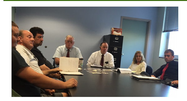
MARA leaders meet with Maine BMV

The NMVTIS website lists call AutoDataDirect as a consolidator providing free reporting for salvage yards. Call them at 866-923-3123. Or go to their website: salvage@add123.com. You will find that ADD provides round-the-clock ability to report on vehicles, and their basic service—for smaller yards-- is free. Higher volume yards may want to subscribe to ADD's Full Service membership which allows for reporting multiple vehicles at a time, for $0.35 per vehicle.